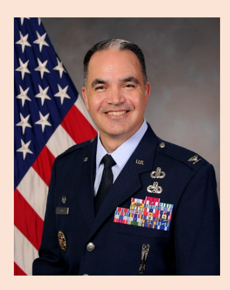
JASON F. VATTIONI, Colonel, USAF Commander, 377th Air Base Wing Kirtland Air Force Base

Please be aware of the efforts continually made by KAFB staff members to provide the highest quality of drinking water by improving the treatment process and protecting the groundwater source. KAFB is committed to supplying you with the best drinking water possible.