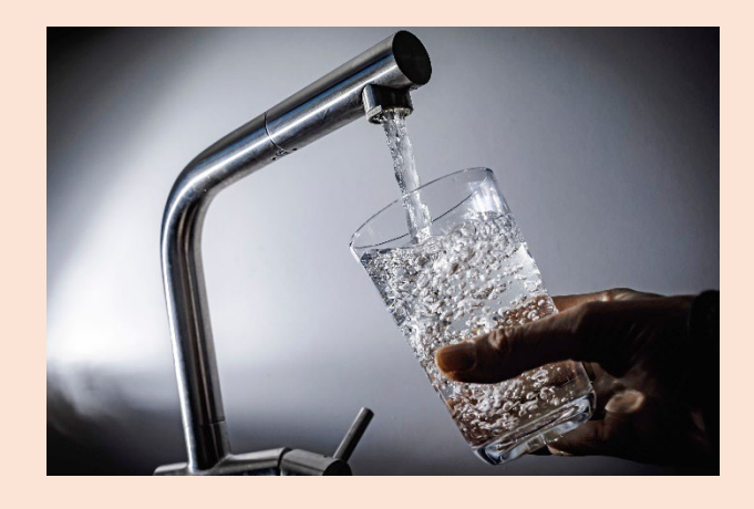
A guide to understanding the quality of the drinking water supplied to you.